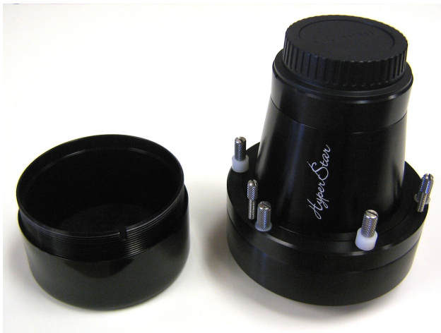
Secondary holder (shipped attached to lens) & HyperStar lens